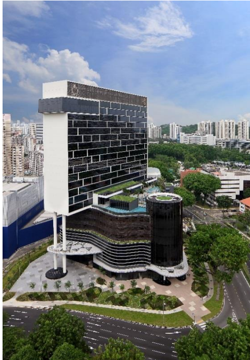
Park Hotel Alexandra

In Singapore, the group has also developed and owns the Park Hotel Alexandra. It is situated just ten minutes from Orchard Road and Sentosa, and 30 minutes from Changi International Airport. The 442-room hotel has enjoyed strong occupancy since its opening in 2015.