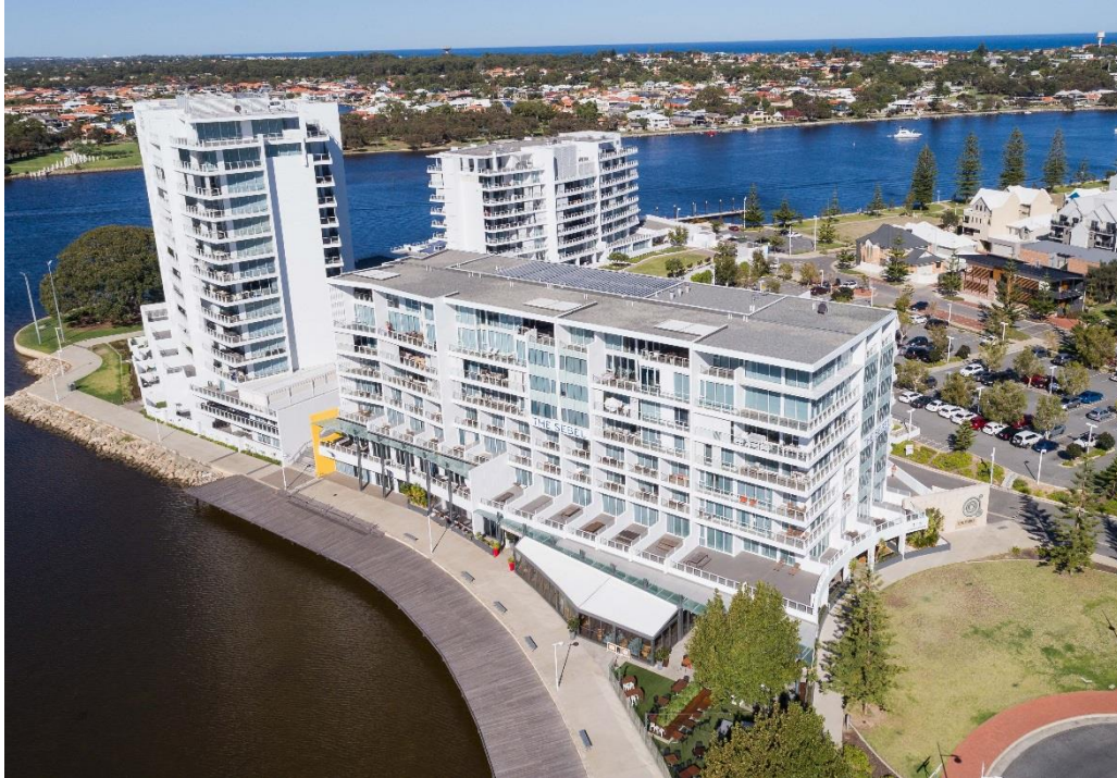
The Sebel Mandurah

Built in 2009 and managed by AccorHotels, the hotel boasts impressive views across the Mandurah canals, and is located 50 minutes from Perth CBD and airport. The purchase also includes the strata restaurant property leased and operated by The Peninsula Bar & Restaurant, located on the ground floor of the development. Both the hotel and the strata restaurant property are on freehold titles.