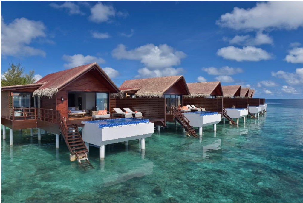
Grand Park Kodhipparu