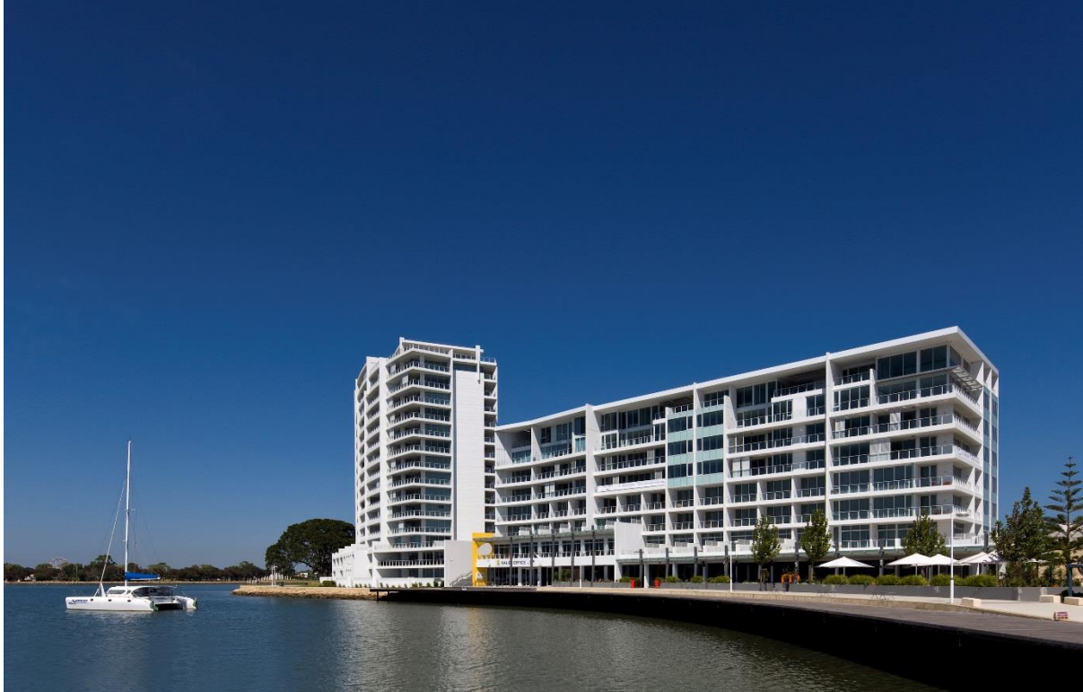
The Sebel Mandurah

1 August, 2017 – Chip Eng Seng Corporation Ltd (CES) is pleased to announce that it has contracted to purchase The Sebel Mandurah and a strata restaurant property, in Mandurah, Western Australia for AUD15 million.